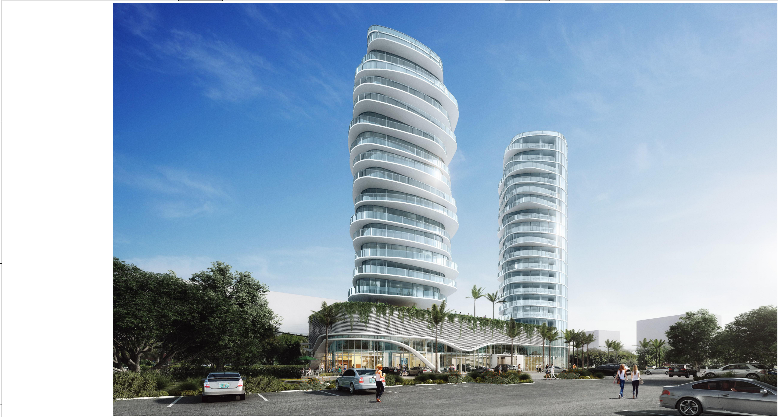
4 RENDER SCALE 1/4" = 1'-0"